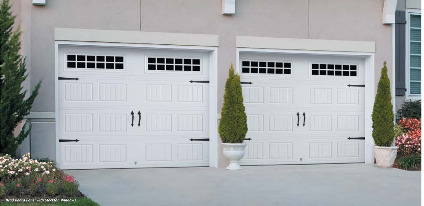
Bead Board Panel with Stockton Windows

Design and energy efficiency make the Designer's Choice doors popular models. With triple-layer construction, a thermal seal, and superior insulation R-value of 15.67 or 11.04, these durable, low-maintenance doors give you the ultimate in quiet operation and energy efficiency.